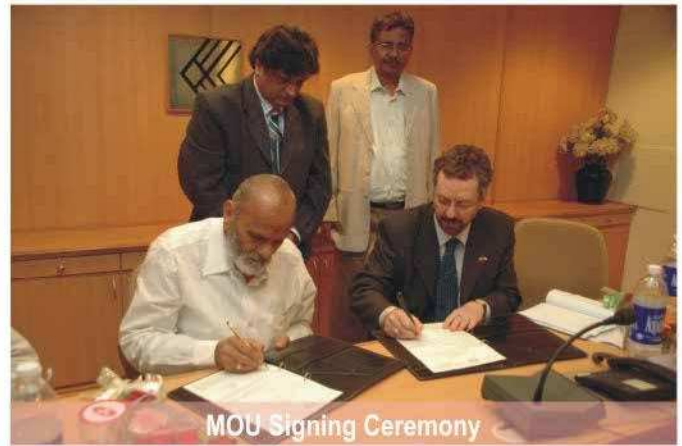
MOU Signing Ceremony

To enable the students to withstand the global competition, SEMCOM has entered into a Memorandum of Understanding with Vancouver Island University, British Columbia, Canada. This collaboration will enable students to pursue their Masters programme in Business Administration and International Business at the same time. This dual Canadian and British programme is designed to give students an opportunity to combine knowledge and practical experience through the integration of theory, research and practice that can be applied at regional, national and international levels.