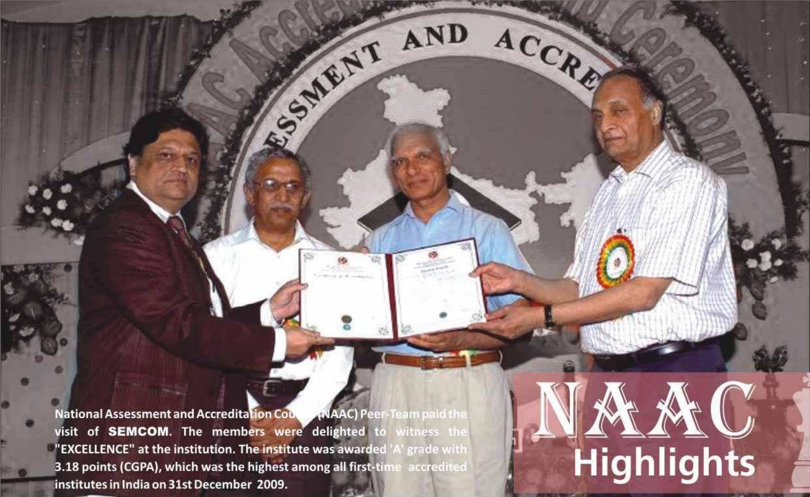
National Assessment and Accreditation Council (NAAC) Peer-Team paid the visit of SEMCOM. The members were delighted to witness the "EXCELLENCE" at the institution. The institute was awarded 'A' grade with 3.18 points (CGPA), which was the highest among all first-time accredited institutes in India on 31st December 2009.