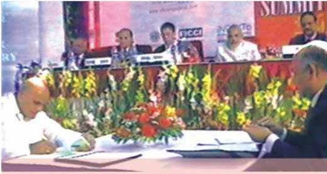
Charutar Vidya Mandal, and Gujarat Industrial Development Corporation, Government of Gujarat

Charutar Vidya Mandal has signed a Memorandum of Understanding with the Government of Gujarat represented by Gujarat Industrial Development Corporation (GIDC). The MOU envisages activities like