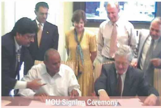
MOU Signing Ceremony

In order to create learning opportunities at the global level, SEMCOM has entered into a Memorandum of Understanding with Georgia SouthWestern State University, USA. The collaboration is synergistic in nature whereby students will have an opportunity to keep in pace with the changing times while in pursuit of their academic goals.