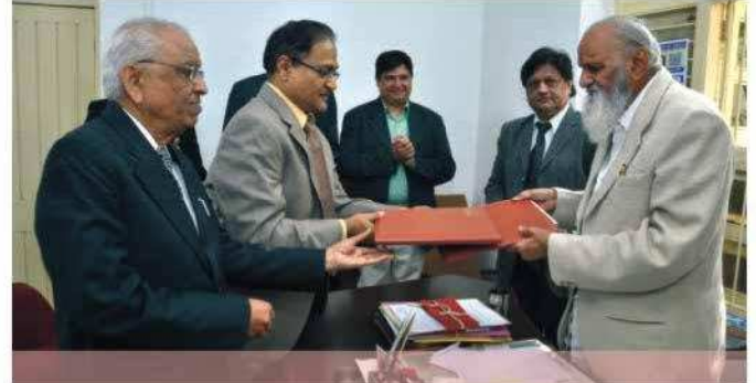
SEMCOM and Elitecore Company Ltd., Ahmedabad

In order to promote excellence in the area of Network and Security education, there has been an initiative between two parties - SEMCOM ( A Charutar Vidya Mandal Institution), Vallabh Vidyanagar and Elitecore Company Ltd., Ahmedabad to collaborate in the field of Information Technology education. The prime objective of MoU is to strengthen the interface between Industry and Academia so as to enhance the quality of education in the discipline of Computer Networks and Network Security which has become an important component of E-Business as well as Information Technology Management.