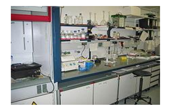
Modern Biochemistry Laboratory