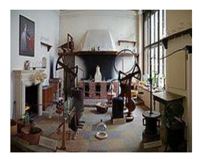
Chemistry Laboratory of the 18th century